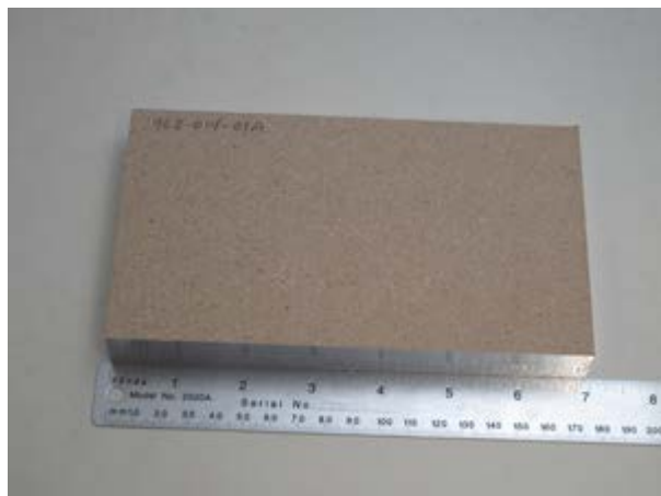
Photo Documentation – The product sample specimen is photographed following specimen preparation. The top and bottom faces of the specimen are photographed.